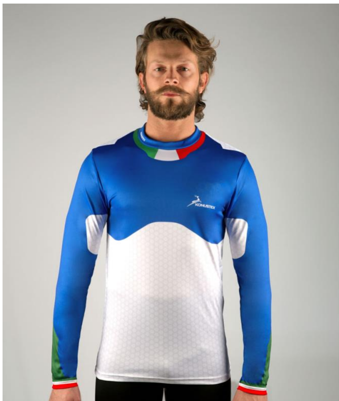
L/S shooting shirt